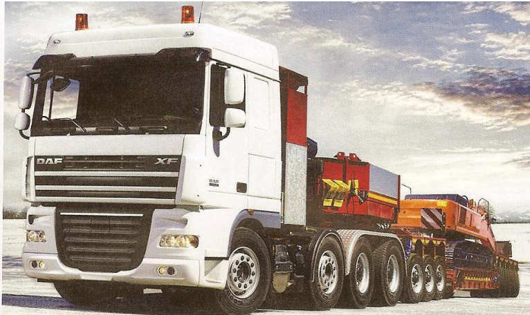
The DAF XF truck is just one of a number of powerful prime mover tractor units available globally.