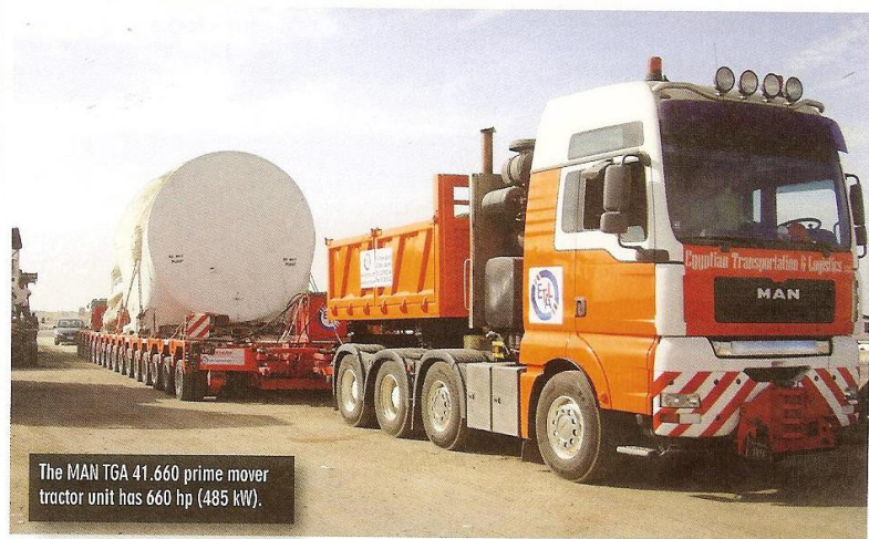
The MAN TGA 41.660 prime mover tractor unit has 660 hp (485 kW).

To find out what actual pulling force in tonnes (to be correct we should use